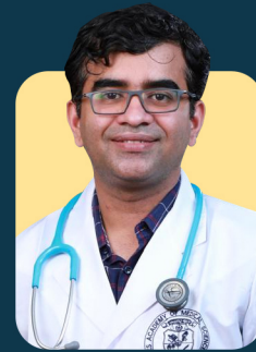
SCIENTIFIC COMMITTEE CONVENER

ASSOCIATE PROFESSOR, DEPT OF ORTHOPAEDICS, MES AMS