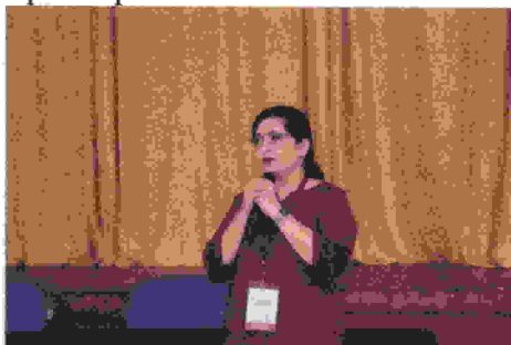
Welcoming the Participants